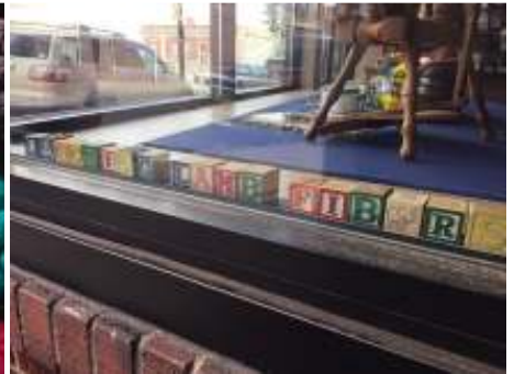
Downtown Sidney, Nebraska – unique shopping experiences along Illinois Street!!