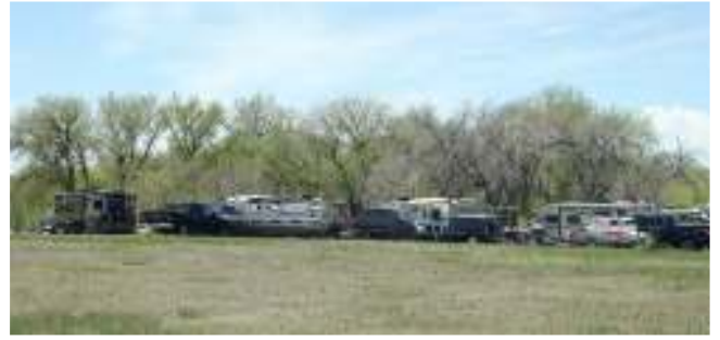
Oliver Reservoir was PACKED over Memorial Day weekend! It was nice to see people enjoying the great outdoors over the long weekend.