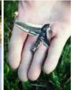
I love springtime!! It is so nice to see flowers blooming and smell the lilac, chokecherry, and plum bushes. We even found a huge moth!