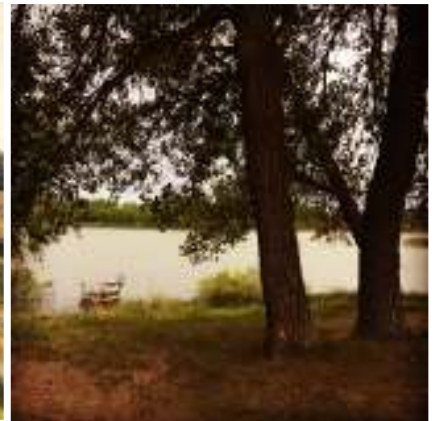
I enjoyed a couple quick trips to Scotts Bluff National Monument, Courthouse and Jail Rocks, Chimney Rock, and of course we spent some more time at our local Oliver Reservoir.