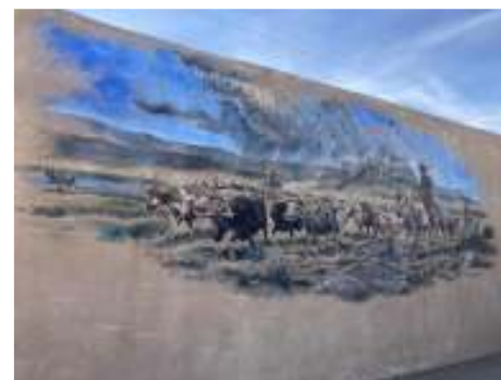
These are just a couple of the murals downtown Scottsbluff – always fun to find art!!