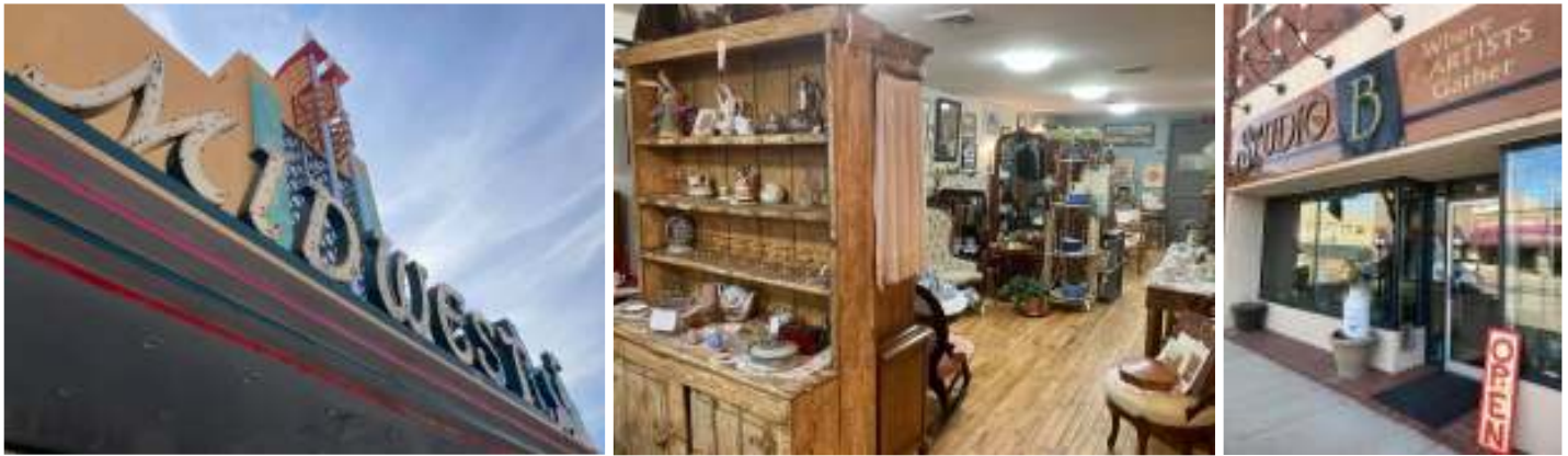
The Midwest Theater – Tossed & Found Antiques – Studio B