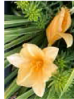
Some beauty in September. I have loved all the flowers of summer, but am looking forward to leaves changing color as well.