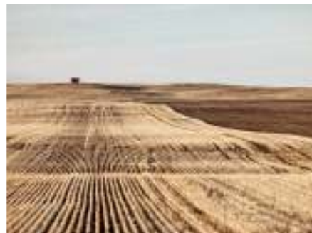
We drove around on the country roads in March and found a herd of deer, along with finding beauty everywhere.