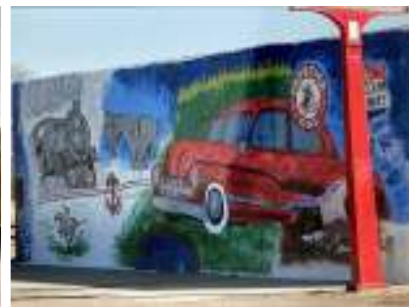
We also found some wonderful murals along the way!!