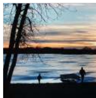
My son loves to throw rocks out at the lake – even though they just bounced across the ice this time!